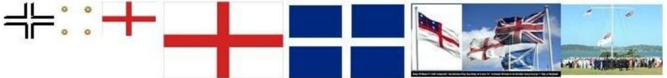
1/ Black cross Navy Military Protectorate against Pirates Satan 2/ 4x St Patrick 8 Pt Star N E S W 3/ Red Cross 7 Kings Blood Lines Continuity of Sovereignty 4/ Big Red Cross of St George of England King George I to VI 5/ Sea of Admiralty & Sky Blue Law 6/ 1834 Declaration of War Emergency Court Martial Law