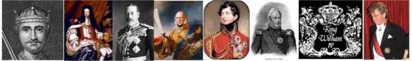
1/ William Conqueror 1066 2/ King William III 1694 3/ King George III 1766 4/ King George IV 1823 5/ King William IV 1834 6 King Ernest Augustus 28/3/19