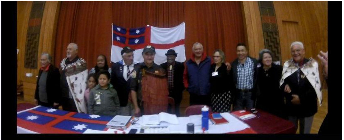
Moai Crown Native Magistrate Kings Bench Court -1/61/77 Cook St Hearing -Te Unga Waka Marae- Epsom Auckland New Zealand