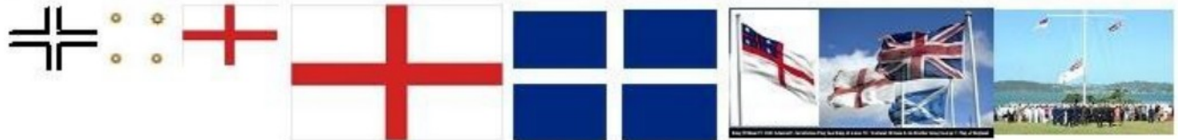
1/ Black cross Navy Military Protectorate against Pirates Satan 2/ 4x St Patrick 8 Pt Star N E S W 3/ Red Cross 7 Kings Blood Lines Continuity of Sovereignty 4/ Big Red Cross of St George of England King George I to VI 5/ Sea of Admiralty & Sky Blue Law 6/ 1834 Declaration of War Emergency Court Martial Law