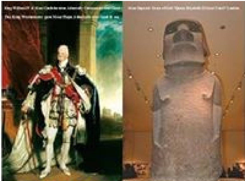
King William IV Magistrate and High Court of Admiralty Martial Law 1820 - 2022

Westminster Parliament England U K 1820 to 1834 Flag