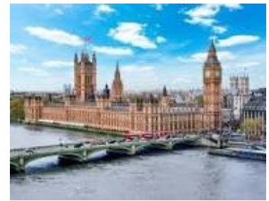
Crown State Default Convictions under Prosecutor King William IV Sovereign Seal Land Sea Jurisdiction & Constitution