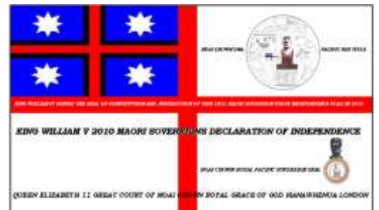
Moai Crown State Default Convictions under Private Prosecutor King William IV Sovereign Jurisdictions!