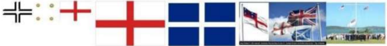
1/ Black cross Navy Military Protectorate against Pirates Satan 2/ 4 x St Patrick 8 Pt Star NES W 3/ Red Cross 7 Kings Blood Lines Continuity of Sovereignty 4/ Big Red Cross of St George of England King George I to VI 5/ Sea of Admiralty & Sky Blue Law 6/ 1834 Declaration of War Emergency Court Martial Law