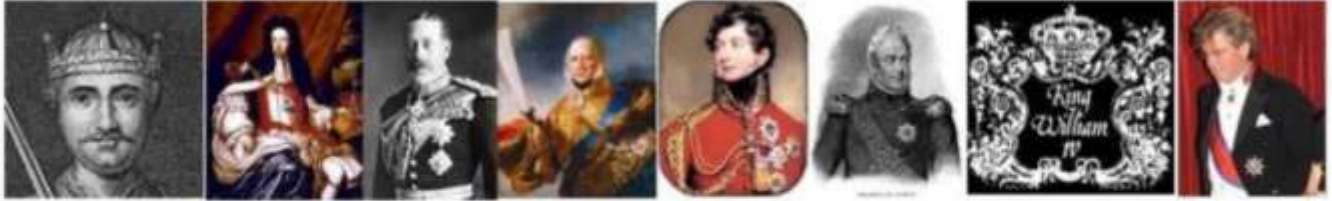
1/ William Conqueror 1066 2/ King William II 1694 3/ King George III 1766 4/ King George IV 1823 5/ King William IV 1834 6 King Ernest Augustus 20/3/19