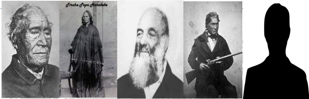
Tāmāti Wāka Nene

approach to Kororareka village and its entire history. There are so many avenues open here. I require a steering committee of sorts to really make the most of the monuments available to me. As my ancestor has its part, it is most certainly not the only one. I would, if for nothing else, leave this legacy for others to pick up. The ambition of my audaciousness is to claim these in this time: