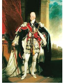
King William IV