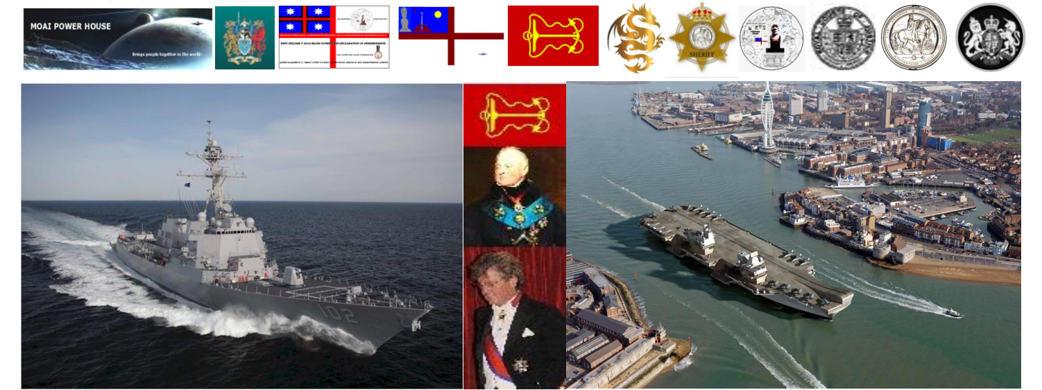
USS Sampson Admiral Tim LaBenz *** King William IV Admiral – King Ernest Augustus V *** Queen Elizabeth II Navy UK

The USS Sampson is on its way to New Zealand for the Royal New Zealand Navy International Naval Review in Auckland later this month.