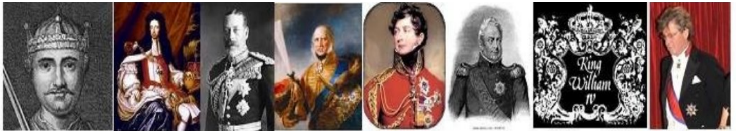
1/ William Conqueror 1066 2/ King William III 1694 3/ King George III 1766 4/ King George IV 1823 5/ King William IV 1834 6 King Ernest Augustus 28/3/19

December 2015 to Thursday 12 January 2023 and beyond inclusive of Interest owing due and payable since 2015 as the Court sees fit to charge at its Discretion and Jurisdiction Legal Authority